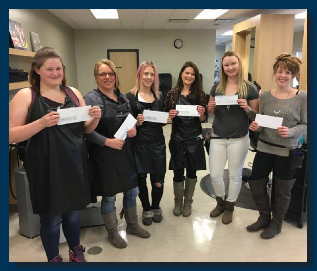
Weyburn Hairstylist students were among the 137 students across the region who received $500 Entrance Awards.