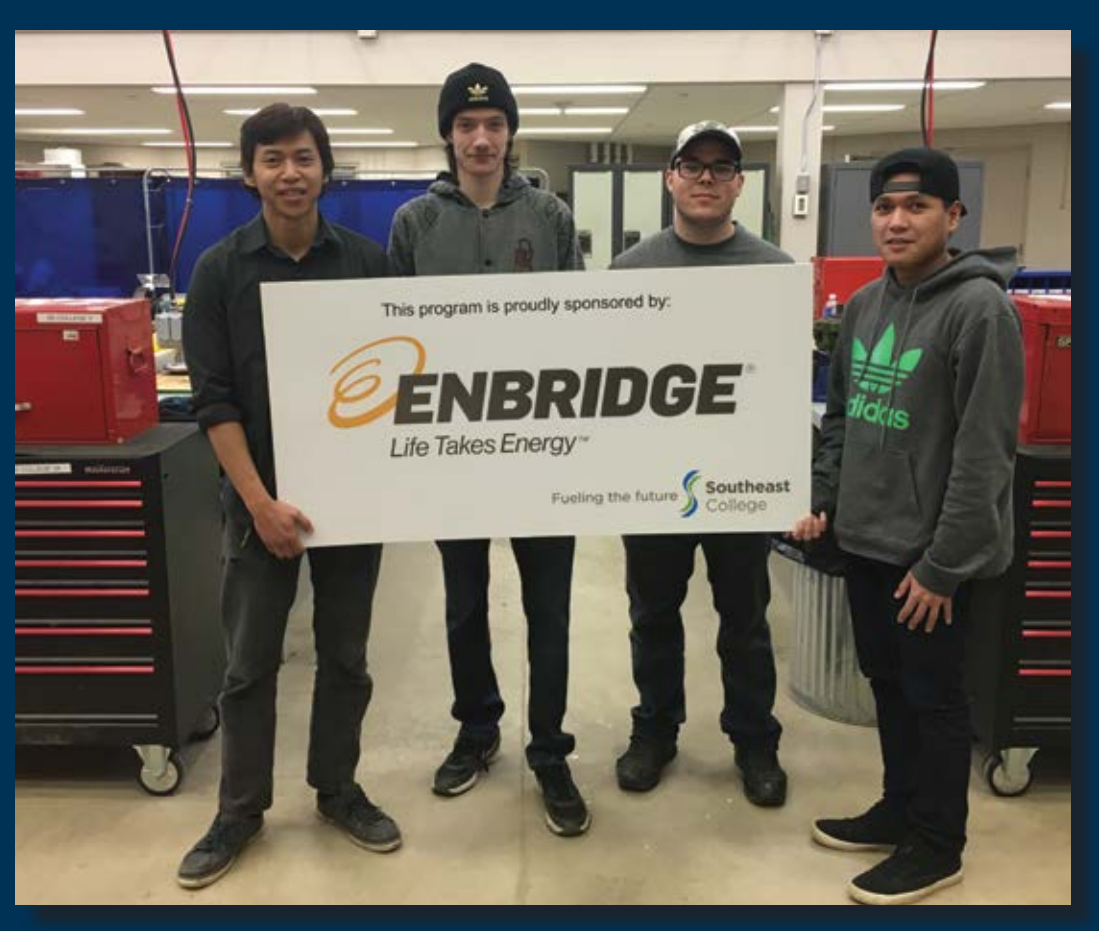
Estevan's Heavy Equipment and Truck and Transport Technician (HETT) students receive support from a number industry partners including Enbridge.